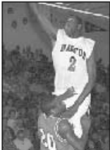
Ebi Ere 2nd Team 2001