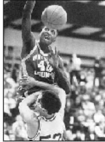
Kenny Williams Indiana Pacers 1990-95